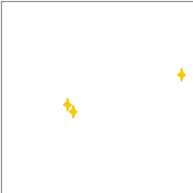
Stop #: 3 Element: Code: 1068 Name: Canary Chart: Madeira Classic 40 Stitches: 287 Thread used: 1.09m